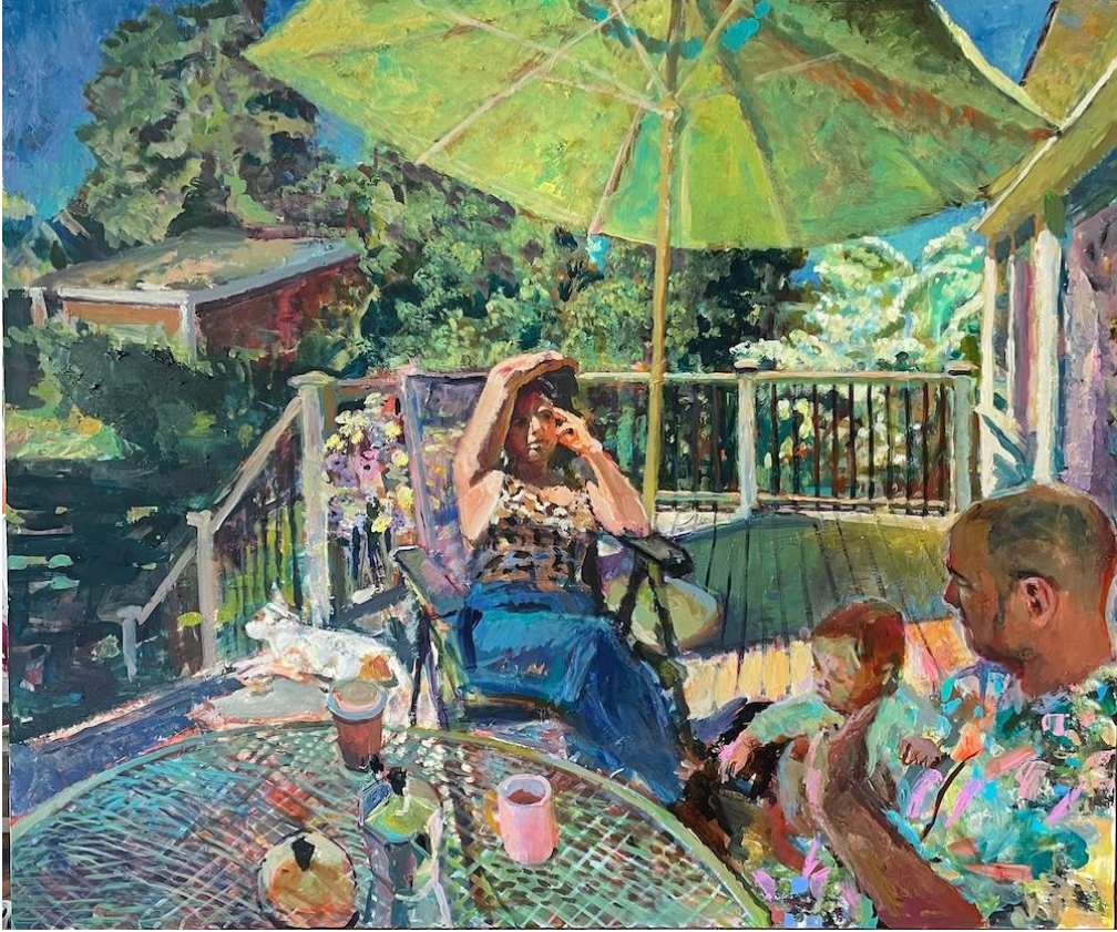
Grant Drumheller, Morning Coffee , 2023 Acrylic on canvas, 60 x 72 inches