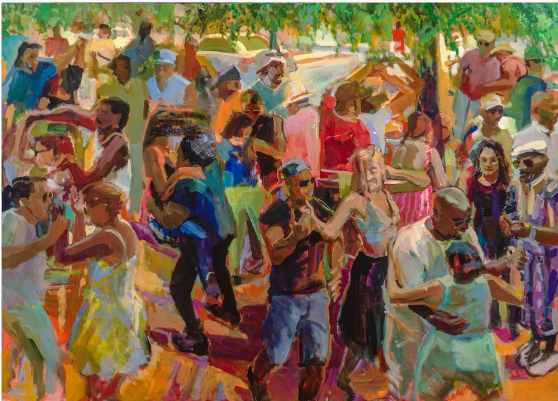
Grant Drumheller, Street Salsa , 2023 Acrylic on canvas, 60 x 84 inches

OPENING RECEPTION: THURSDAY, OCTOBER 3, 5 – 8pm HOURS: TUESDAY – SATURDAY, 11–6